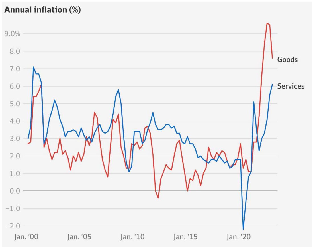
Chart: Michael Read

smaller price rises for goods, as well as lower food inflation. Heavy discounting caused the price of clothing and footwear to fall by 1 per cent in the first three months of the year, while inflation in the price of furniture and appliances also eased. Goods inflation globally has softened recently thanks to falling shipping costs and the resolution of supply chain issues. Inflation in the cost of building a new dwelling – the largest item in the CPI basket –slowed to 13 per cent, down from a peak of 21 per cent last year, thanks to an easing in material cost pressures and softening demand.